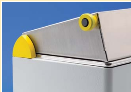
Robust, practical gable cover