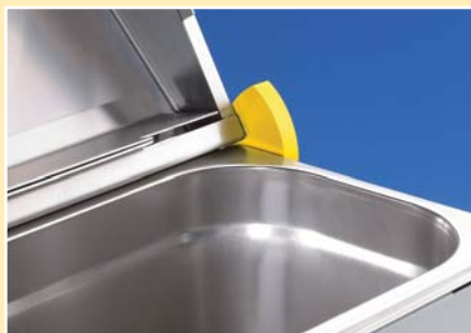
Easy-to-clean bath vessel