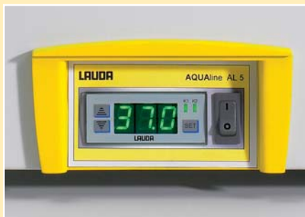
Easy-to-read LED display