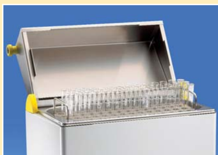
Optimum use of the bath

The LAUDA Aqualine is the start of the thermostating chain for research and industrial purposes, and offers an economical introduction into the world of thermostating. Easy operation via the digital LED display enables fast start-up without the need for complicated settings.