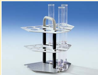
Racks stainless steel up to 100 °C

You can find a selection of important accessories for the LAUDA Aqualine water baths on this page. Please see the LAUDA accessories brochure for more accessories.