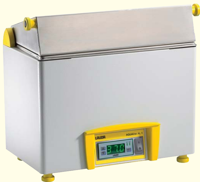
AL 5 water bath

the number of samples per bath is maximised. Above all, the LAUDA Aqualine is orientated towards the requirements of biological, medical and biochemical laboratories. A superbly innovative heating concept ensures minimum temperature variations in the baths even with large sample quantities.