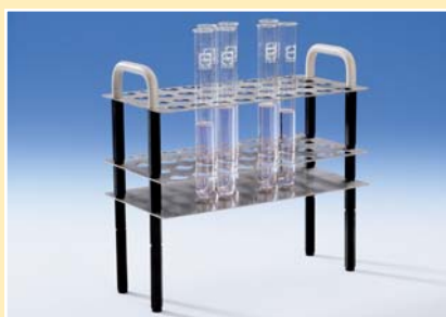
Racks stainless steel up to 100 °C

Racks with polymer handles for comfortable use in water baths