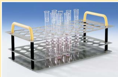
Racks stainless steel up to 100 °C

Racks with polymer handles for comfortable use in water baths