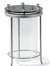
3 liter bioreactor