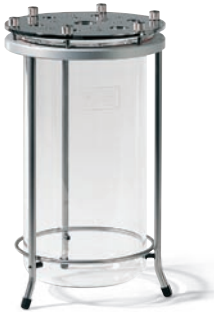
7 liter bioreactor