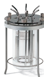
1 liter bioreactor

Each BioBundle system component is thoroughly tested and evaluated based on many years of successful usage in a wide range of applications. Below is a partial listing of the components included in the BioBundle system.