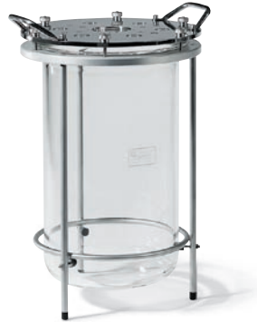
15 liter bioreactor