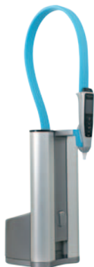
PURELAB flex 2