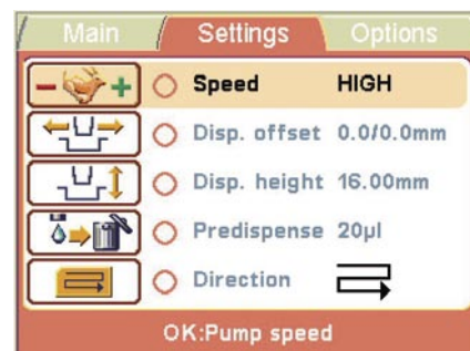
Multidrop Combi's highly visual user interface helps you quickly start dispensing though enabling customized settings.