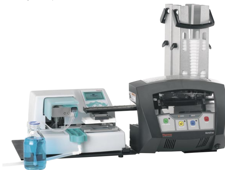
RapidStak with Multidrop Combi creates a complete benchtop solution for automated bulk reagent dispensing.